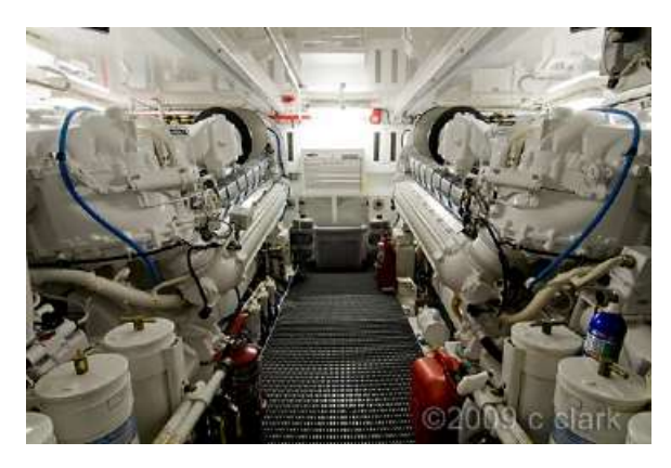
Engine / Mechanical Equipment