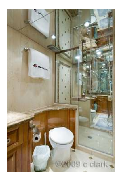
Forward Guest Stateroom