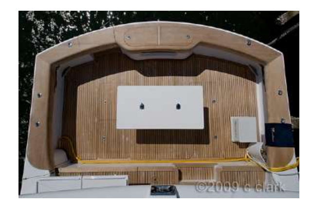
Engine / Mechanical Equipment