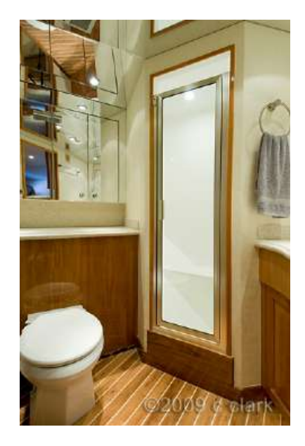
Starboard Guest Head