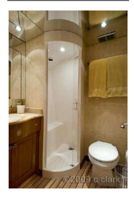
Starboard Guest Head