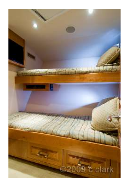
Port Guest Stateroom